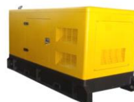
Super Silent Canopy